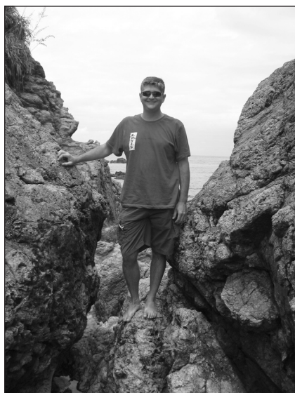
Costa Rica 2006

toring profession, including establishing a greater sense of autonomy in all settings. Sometimes, (and I think this is especially true for those in acute care, SNF, and LTC settings), seeing ourselves as autonomous (yet collaborative) is a difficult thing. We must understand that our professional preparation allows us to function as decision-makers. Too many times, we do not take leadership roles, nor do we assert our knowledge in the role of a consultant. We must begin to see ourselves in this light, and function as the experts we are during team meetings, utilization reviews, setting RUGs levels, and in care planning. Particularly when we work in hospitals, sub-acute, SNF, home health, or LTC settings.