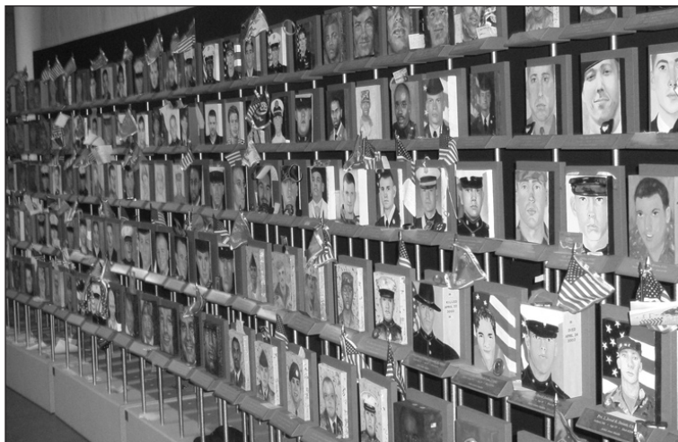
The pictures in the background represent soldiers who have lost their lives during the Iraq War.