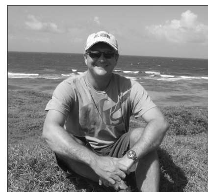
St. Croix, US Virgin Islands 2006

Right now, the most pressing issue is being able to define ourselves as a doc-