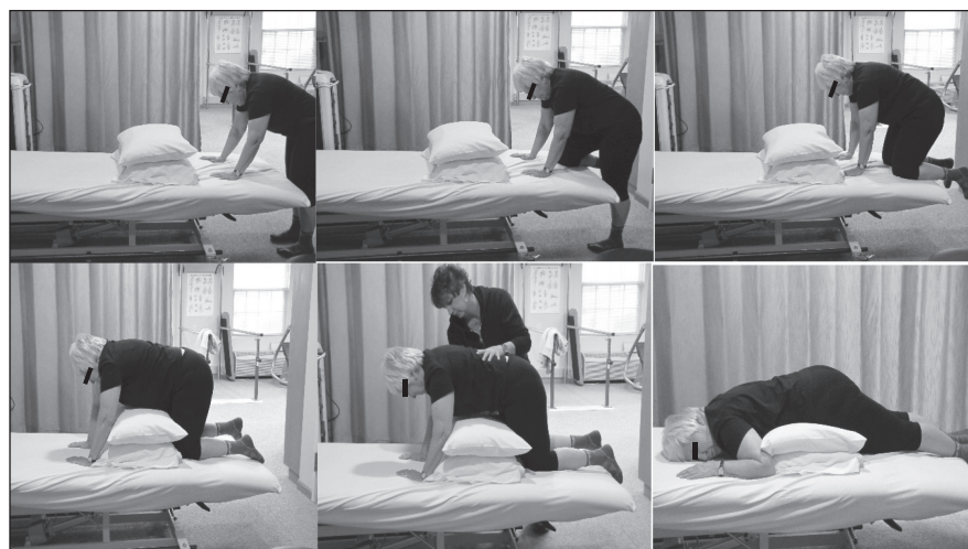
Figure 1. The steps used to ease patient into Tummy Time for prone exercises/activities. Patients may assume prone on elbows if there is no indication of pain. This will allow mild lengthening of anterior muscle groups. Prone exercises are performed in resting position not prone on elbows. Initially, hot moist packs and massage will provide for additional comfort in this position and increase awareness of the posterior aspect of her body.

The Prone to Foam program has been the most popular aspect of my continuing education course this year. The primary focus is using gravity to our advantage reversing the symptoms of the MP1 and MP2 of the COA. Prone positioning allows for gravity assisted pelvic movement. It is gentle, relaxing for the patient, and proven to be safe. This is what we call our “ tummy time ” for the geriatric patient. Tummy time is often recommended in infants to encourage extension strength. This activity assists in preparation for the strength